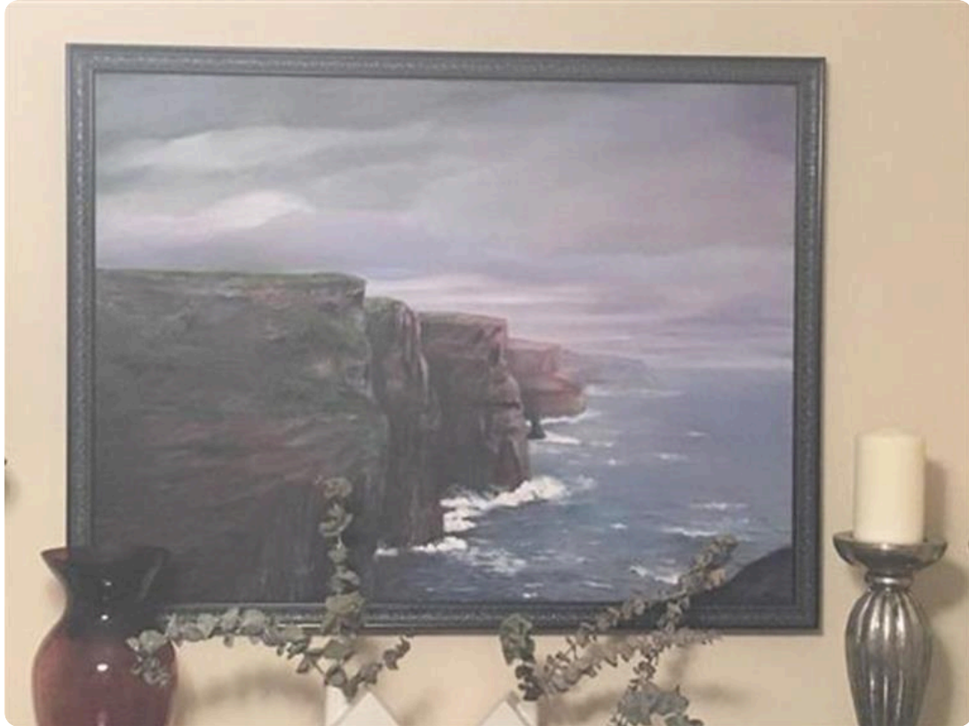
Commissioned art of the Cliffs of Moher